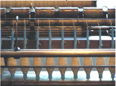
..and fed into a machine ...