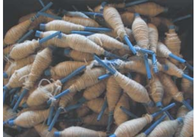
.. and woven onto spindles ..